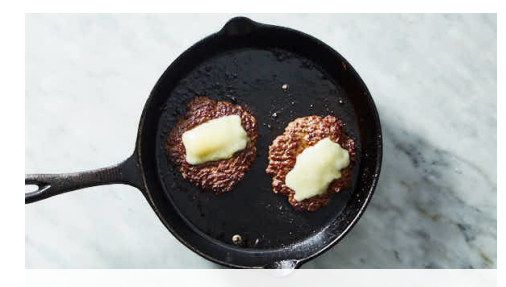
5. Cook burgers

Heat 1 tablespoon oil in same skillet over medium-high. Add Actual Veggies™ burgers and cook until well browned on the bottom, 2-3 minutes. Flip burgers, then top each with cheese . Cover and cook until cheese is melted and burgers are warmed through, 2-3 minutes.