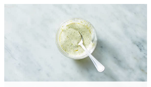
6. Make sauce & serve

Heat 2 teaspoons oil in same skillet over medium-high. Add Impossible patties and cook until well browned, 2-3 minutes. Flip burgers, then top each with cheese . Cover and cook until cheese is melted and burgers are warmed through, 2-3 minutes.