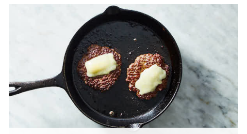
5. Cook burgers

Lightly brush cut sides of buns with oil . Heat a medium skillet over medium-high. Add buns, oiled sides down, and toast until lightly browned, 1-2 minutes (watch closely). Transfer buns to plates. Coarsely chop all of the cheese .