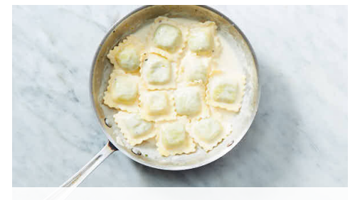
5. Add ravioli

Add % cup of the reserved cooking water and lemon juice. Cook, stirring to scrape up any browned bits from the bottom of skillet, 1-2 minutes.