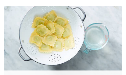
3. Cook ravioli

Melt 2 tablespoons butter in a medium skillet over medium-high heat. Add mushrooms and season with salt and pepper ; cook, stirring occasionally, until browned and dry (water will release from mushrooms then evaporate while cooking), 4–5 minutes.