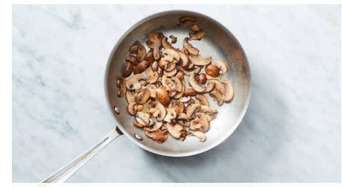
2. Sauté mushrooms

Finely grate all of the Parmesan , if necessary.