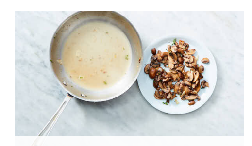
4. Start sauce

Reserve 1 cup cooking water . Drain ravioli; set aside in colander until step 5.