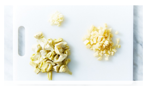
2. Prep ingredients

Preheat oven to 425°F with a rack in the center. Scrub sweet potato , then cut into ½-inch thick wedges. On a rimmed baking sheet, toss sweet potatoes with 1 tablespoon oil and season with salt and pepper . Roast on center oven rack until brown and tender, tossing halfway through, about 20 minutes total.