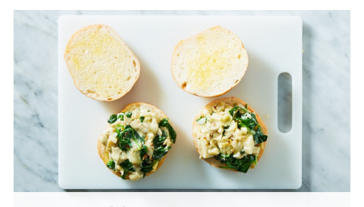
5. Assemble panini

Add spinach to skillet with artichokes and cook over medium-high heat until wilted, about 1 minute. Transfer spinachartichoke mixture to a medium bowl. Wipe out skillet.