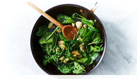
4. Wilt spinach

Heat 1½ tablespoons oil in a medium nonstick skillet over medium-high. Add chopped garlic, artichokes, and a pinch of crushed red pepper (or more depending on heat preference); season with salt and pepper. Cook, stirring, until garlic is fragrant and artichokes start to brown, about 4 minutes.