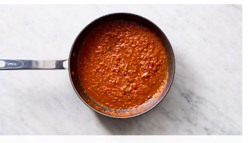
3. Cook sauce

Reduce heat under skillet with mushrooms to medium. Add 1 tablespoon oil and continue to cook, stirring frequently, until mushrooms are crispy and browned, 3–5 minutes more. Stir in 1 teaspoon smoked paprika . Transfer to a paper towel-lined plate; season with salt . Reserve skillet.