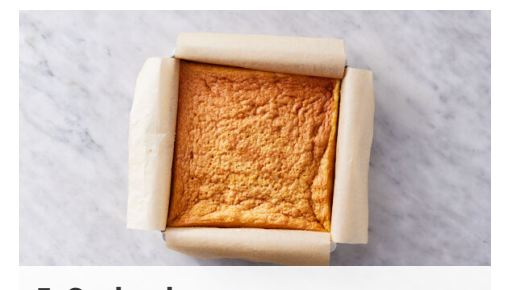
5. Soak cake

Reduce speed to medium-low and mix until smooth and velvety in texture, about 5 minutes. Add flour mixture to eggs in 3 additions, using a spatula to gently fold until flour is just incorporated and no dry bits remain. Add ¼ cup batter to bowl with milk-butter mixture ; whisk until combined. Return mixture to batter and gently fold until thoroughly combined.