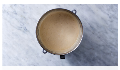
3. Mix batter

To the bowl of a stand mixer fitted with the whisk attachment, add % cup sugar and 4 cold large eggs . Whip on high speed until pale, doubled in volume, and thick enough to briefly mound up on itself when dropped from whisk, 7-10 minutes.