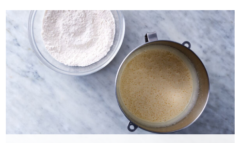
2. Whip eggs

Transfer batter to prepared baking dish; tap a couple of times on counter to knock out large air bubbles. Bake cake on center rack until puffed, the center springs back when touched, and a toothpick inserted in the center comes out clean, 25–30 minutes. Remove from oven and drop pan 8 inches above work surface. Let cake cool in baking dish on a wire rack for 10 minutes.