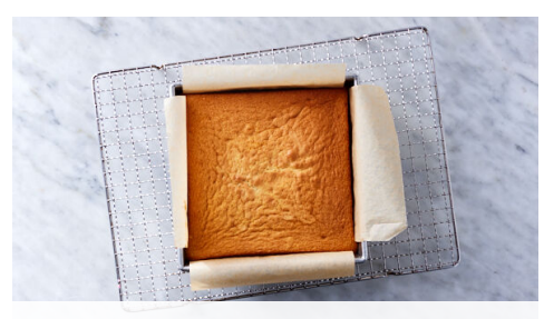
4. Bake cake

In a small saucepan, heat ½ cup whole milk and 6 tablespoons butter over low until butter is melted. Remove from heat, stir in 1 teaspoon vanilla, and transfer to a small bowl.