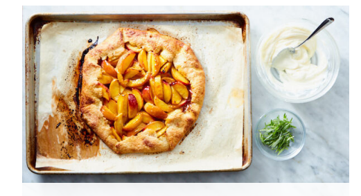
4. Finish & serve

In a second small bowl, combine all of the apricot preserves and 1 tablespoon water; gently brush over peaches.