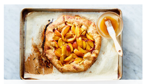
3. Bake galette

Fold border of dough up and over some of the filling, overlapping dough as needed (galette will be about 10 inches). Pour remaining peach liquid from bowl over filling.