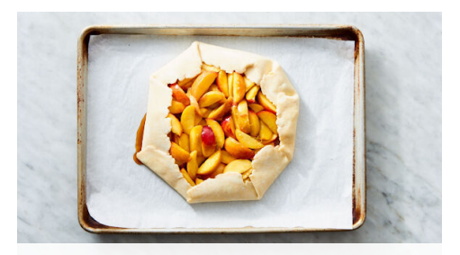
2. Assemble galette

Preheat oven to 400°F with a rack in the center. Halve peaches ; remove pits. Cut each half into ½-inch thick wedges. Zest half of the lemon into a medium bowl; juice half of the lemon into same bowl (save rest for own use). Add peaches , brown sugar , 1 teaspoon vanilla, and ½ teaspoon salt; stir to combine.