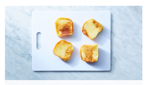
3. Toast buns

In a large bowl, combined chopped lettuce , tomato , onion , cucumber , olives , and pepperoncini ; set aside. In a medium bowl, whisk together 1 tablespoon Italian seasoning and balsamic vinaigrette ; season to taste with salt and pepper and set aside.