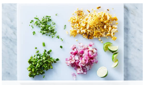
3. Prep salad

Grill Actual Veggies<sup>™</sup> burgers over medium heat until lightly charred on one side, about 4 minutes. Flip, top each with cheddar, and grill, covered, until cheese is melted, 2-3 minutes. Split buns and grill, cut sides down, until toasted, 1 minute. Serve Actual Veggies<sup>™</sup> burgers on toasted buns with salad alongside and lime wedges for squeezing. Enjoy!