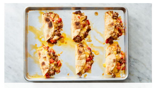
6. Broil & serve

Brush one side of each tortilla generously with neutral oil . Arrange tortillas on a rimmed baking sheet, oiled side down. Divide veggie ground mixture among tortillas, spooning filling onto 1 half of each tortilla, then top with shredded cheddar-jack cheese . Fold in half to close. Transfer to a baking sheet in a single layer.