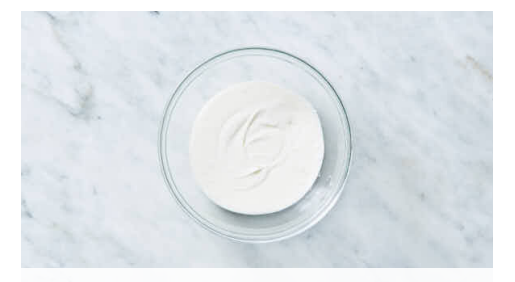
5. Make whipped buttermilk

Roll dough into a rectangle about ½-inch thick; cut into 4 equal-sized shortcakes. Spread out on a parchment-lined baking sheet and brush tops with remaining thinned mascarpone . Sprinkle tops with raw sugar . Bake for 8-10 minutes, or until tops are lightly golden and shortcakes are puffed and layered. Remove from oven and transfer to a cooling rack.