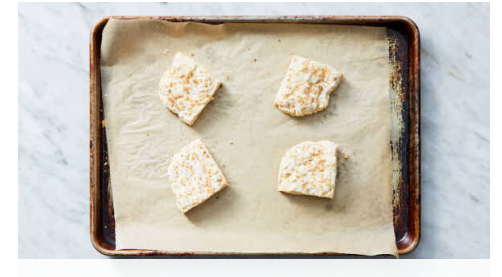
4. Bake shortcakes

Cut 4 tablespoons cold unsalted butter into ½-inch pieces. In a large bowl, mix flour, 1 tablespoon each of granulated sugar and baking powder, and ¼ teaspoon salt. Mix butter and flour with your fingers until it resembles coarse crumbs. Gently stir in 8 tablespoons of the thinned mascarpone until combined. Transfer dough to a clean surface; knead until dough just comes together.