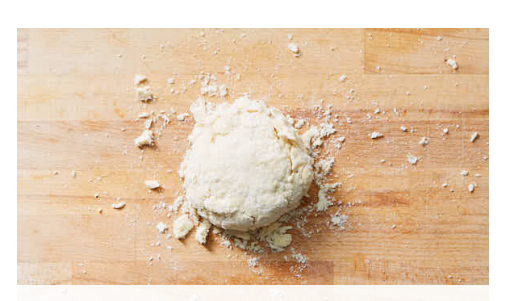
3. Make dough

In a small saucepan, stir to combine tarragon and ½ cup each of granulated sugar and water. Cook over medium heat, stirring until sugar dissolves and mixture is simmering, about 1 minute. Remove from heat; stir in nectarines and ½ teaspoon vinegar. Set nectarines aside until step 6.