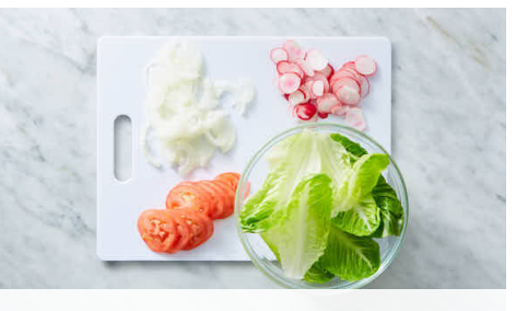
1. Prep ingredients

Calories 620kcal, Fat 32g, Carbs 52g, Protein 29g