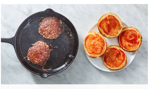
3. Toast buns

In a small bowl, combine all of the sour cream and half of the ranch seasoning (save rest for own use). Thin with water , 1 teaspoon at a time, to reach desired consistency. Season to taste with salt and pepper .