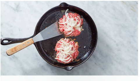
2. Cook burgers

Add all but 2 lettuce leaves and toss to coat.