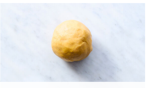
3. Make crust

Return yolk mixture to saucepan. Cook over medium heat, whisking constantly until cream begins to bubble and thicken, 2-4 minutes. Once it bubbles, continue cooking and whisking for 1 minute. Off heat, whisk in 4 tablespoons butter and 1 teaspoon vanilla . Strain cream though a fine mesh sieve into a medium bowl. Press a piece of plastic against surface; refrigerate until cold.