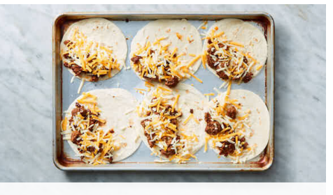
4. Assemble quesadillas

In a medium bowl, toss cucumbers with 2 teaspoons each of the chopped garlic, vinegar, and sesame seeds, 1 teaspoon each of tamari, sesame oil, and sugar, and ½ teaspoon salt. Set cucumbers aside until ready to serve.