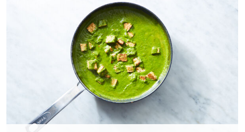
5. Cook sauce

To a blender, add spinach, tomatoes, remaining coconut milk, chopped garlic and ginger, garam masala, 2 teaspoons of the cumin seeds and oil, 34 teaspoon salt, and a few grinds of pepper. Blend on high until smooth.