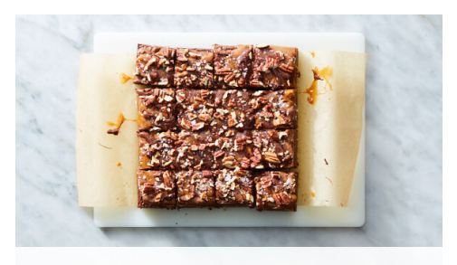
6. Drizzle & serve

Remove baking dish from oven and firmly smack against the kitchen counter to deflate. Allow brownies to cool completely in the dish, 1½-2 hours. Once cool, place caramel bits and remaining chocolate chips in 2 separate small microwave-safe bowls. Add 2 tablespoons water to caramel. Microwave each, one at a time, in 30 second increments, stirring in between, until melted and smooth.