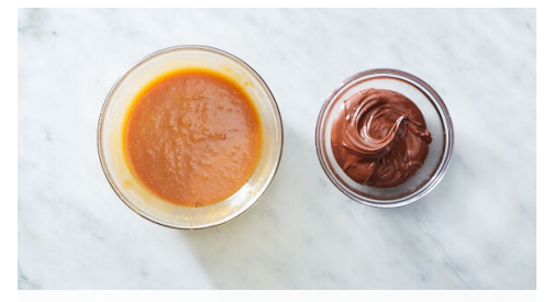
5. Melt caramel & chocolate

Add ½ cup flour to bowl and mix on low speed until just combined. Pour batter into prepared baking dish, using a spatula to spread batter to corners. Bake on center oven rack until brownies are glossy, barely firm, and a toothpick inserted in the center comes out with just a few moist crumbs attached, 25-30 minutes.