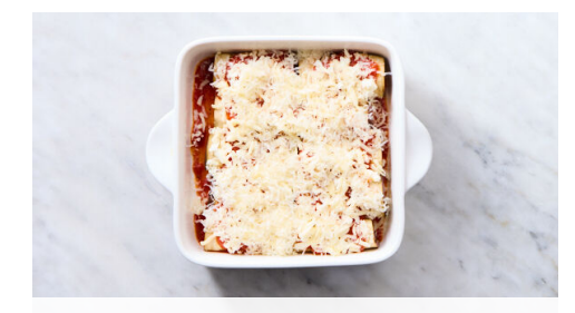
4. Assemble rollatini

Spread a thin layer of marinara sauce on the bottom of an 8x8-inch baking dish.