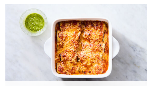
5. Bake & serve

Arrange eggplant slices on a work surface. Divide filling among slices and roll up, starting with the narrower end. Arrange rollatini , seam-side down in prepared dish. Spoon over remaining marinara sauce and top with remaining mozzarella , fontina , and Parmesan .