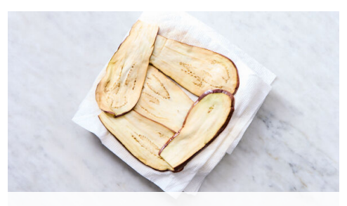
2. Prep eggplant

Preheat oven to 400°F with a rack in the upper third. Trim top of eggplant to remove stem. Thinly slice lengthwise into ½ -½-inch slices, discarding end slices (should yield about 10 slices total).