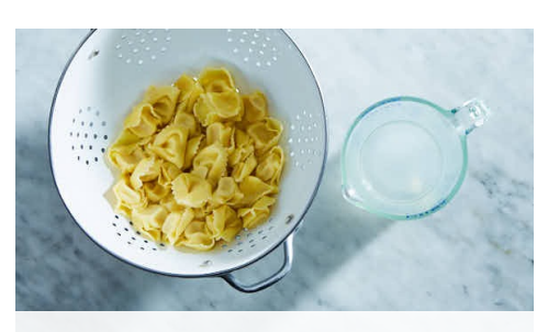
3. Cook tortelloni

Heat 1 tablespoon oil in a medium skillet over medium-high. Add bread cubes and cook, stirring occasionally, until golden and crisp, 3-4 minutes. Transfer to a plate. Wipe out skillet and reserve for step 4.