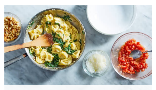
6. Finish tortelloni & serve

Off heat, add cream cheese and 4 cup of the cooking water to spinach . Cook over medium-low heat, stirring to melt completely. Stir in 3 of the Parmesan in large pinches to avoid clumping; season generously with pepper .