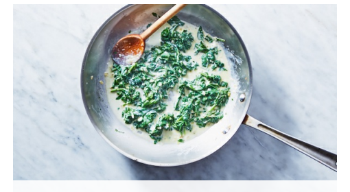
5. Make creamed spinach

Meanwhile, heat 1 teaspoon oil in reserved skillet over medium-high. Add remaining chopped shallots and cook, stirring occasionally, until golden, about 1 minute. Add spinach in large handfuls as it wilts. Toss until all is wilted, about 1 minute. Season to taste with salt and pepper .