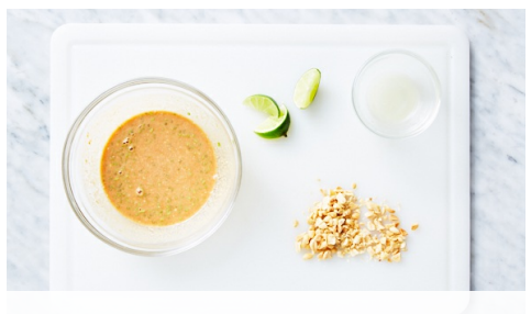
3. Prep sauce

Heat 1 tablespoon oil in a medium skillet over high. Add zucchini , asparagus , and a pinch of salt . Cook, stirring occasionally, until vegetables begin to soften and are charred in spots, 5-7 minutes. Transfer to a bowl and cover to keep warm. Reserve skillet for step 5.