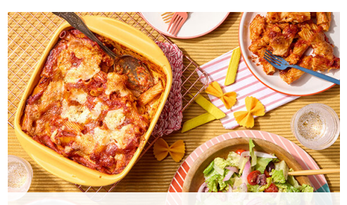
6. Dress salad; serve

In a small lidded container, combine balsamic dressing and ½ tablespoon Italian seasoning. Cover and set aside until ready to serve.