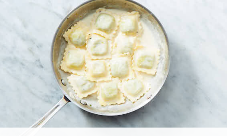
5. Add ravioli

Reserve 1 cup cooking water . Drain ravioli; set aside in colander until step 5.