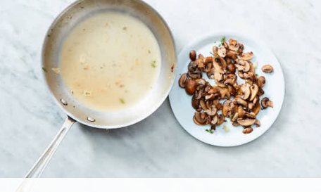
4. Start sauce

Finely grate all of the Parmesan , if necessary.