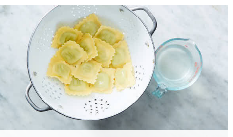
3. Cook ravioli

Melt 2 tablespoons butter in a medium skillet over medium-high heat. Add mushrooms and season with salt and pepper ; cook, stirring occasionally, until browned and dry (water will release from mushrooms then evaporate while cooking), 4-5 minutes.