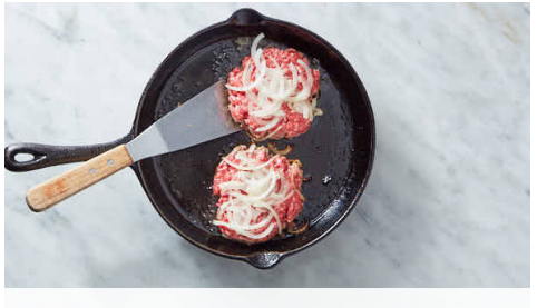
2. Cook burgers

Add all but 2 lettuce leaves and toss to coat.