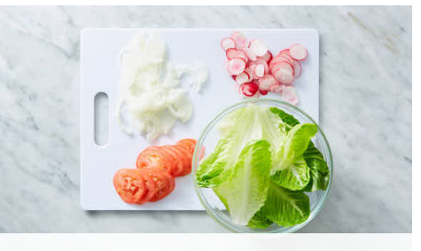
1. Prep ingredients

Calories 620kcal, Fat 32g, Carbs 52g, Protein 29g