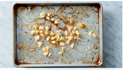
3. Bake croutons

While eggs cook, trim mushrooms and thinly slice caps. On a rimmed baking sheet, toss mushrooms with 2 tablespoons oil, BBQ spice blend, a generous pinch of salt, and a few grinds of pepper. Roast mushrooms on upper oven rack until deep golden-brown and starting to crisp, about 20 minutes. Transfer to a plate.