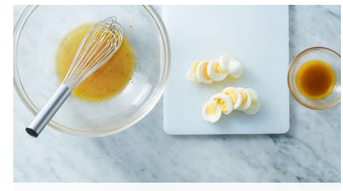
5. Make dressing

While croutons bake, trim cucumber (peel, if desired), then halve lengthwise, scoop out seeds, and cut into ½-inch pieces. Core tomato and cut into ½-inch pieces. Halve lettuce lengthwise, then cut crosswise into ½-inch slices, discarding end.