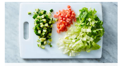
4. Prep salad

Onto same baking sheet, finely grate ½ teaspoon garlic and tear roll into bitesized pieces. Drizzle with oil, then toss bread and garlic with a pinch each of salt and pepper. Bake on upper oven rack until toasted, about 5 minutes (watch closely as ovens vary).