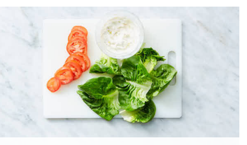
3. Prep toppings

Preheat a grill on high, if using. Remove and discard stems from portobello mushrooms . Use a spoon to scrape the dark brown/black gills from the insides of mushrooms. Drizzle mushrooms with 1 tablespoon each of vinegar and oil ; use your fingers to massage into mushrooms. Season all over with salt and pepper .