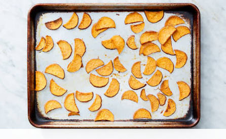
1. Roast sweet potatoes

Calories 920kcal, Fat 57g, Carbs 89g, Protein 24g