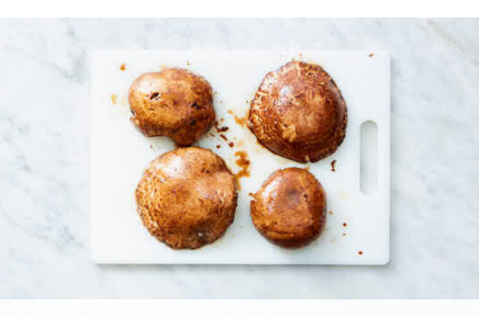
2. Prep mushrooms

Preheat oven to 425°F with a rack in the upper third. Scrub sweet potato ; halve lengthwise, then cut crosswise into ¼-inch thick half moons. On a rimmed baking sheet, toss sweet potatoes with 2 tablespoons oil and ½ teaspoon chipotle chili powder ; season with salt and pepper . Roast on upper oven rack until golden brown, 20-25 minutes.