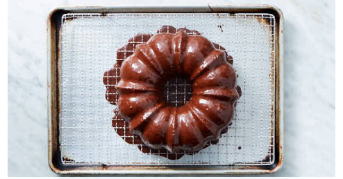
5. Make chocolate glaze

If using a bundt pan, place the pan upside down on a cooling rack. If the cake drops out of the pan onto rack, remove the pan. If the cake doesn't drop onto the rack, give it another 5-10 minutes upside down, then very gently shake the pan back and forth to loosen and remove it. Cool cake completely, about 1 hour.