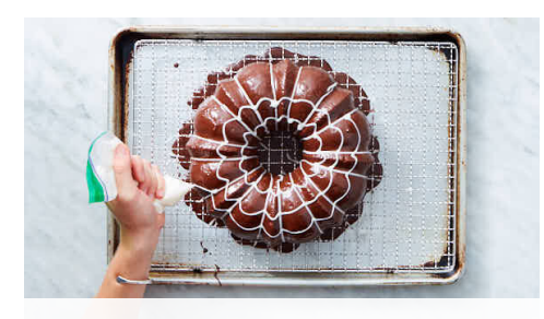
6. Decorate & serve

Once cake is cool, in a medium bowl. whisk to combine cocoa powder and 11/2 cups confectioners' sugar. Slowly stir in 2-4 tablespoons milk and 2 teaspoons vanilla, a little at a time, to make a smooth, pourable glaze. Place cake on a wire rack inside of a baking sheet. Pour glaze evenly over cake, letting it drip down to completely cover top and sides. Let sit for 15 minutes.