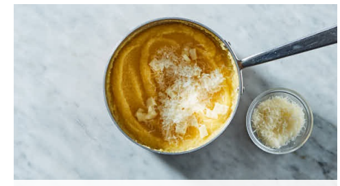
5. Finish polenta

Meanwhile, bring 4 cups water and 1½ teaspoons salt to a boil in a medium saucepan. Whisk in polenta and reduce heat to low. Cook, whisking often, until thickened and tender, 5-7 minutes. Remove from heat.