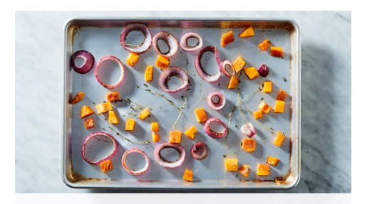
2. Roast vegetables

Preheat oven to 425°F with a rack in the upper third. Peel red onion , then cut into 1-inch slices and separate into rings. Cut butternut squash into ½-inch pieces, if necessary. In a medium bowl, whisk honey , 2 tablespoons vinegar , and 3 tablespoons oil until combined. Season to taste with salt and pepper ; reserve for step 3.