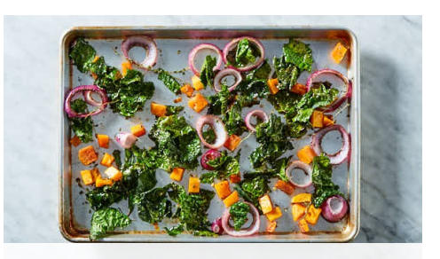
3. Finish vegetables

Transfer onion , squash , and half of the thyme sprigs to a rimmed baking sheet (save rest for own use). Toss vegetables with 1 tablespoon oil , salt , and pepper . Roast vegetables until tender and browned in spots, 20-25 minutes, stirring once halfway through. Discard thyme sprigs.