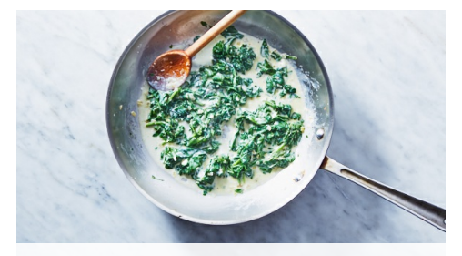
5. Make creamed spinach

Add spinach , season to taste with salt and pepper , and toss until wilted, about 1 minute.