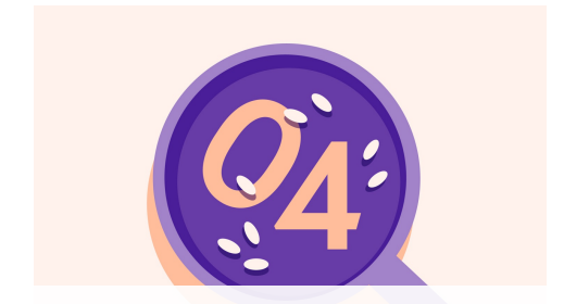
4. Build curry

Meanwhile, in a medium saucepan, heat 1 tablespoon oil over medium-high. Add onions and cook until browned, about 6 minutes. Add curry powder and 1 tablespoon oil. Cook, stirring, until fragrant, 30 seconds.