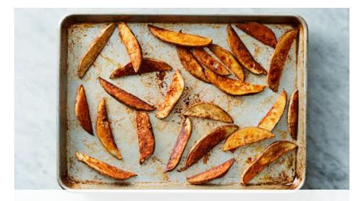
6. Season fries & serve

If skillet is dry, add 1 teaspoon oil over medium heat. Add buns , cut sides down, and toast until lightly browned, about 30 seconds.