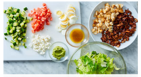
6. Assemble salad & serve

Once eggs are cool, peel and slice crosswise into ¼-inch thick rounds. In a large bowl, whisk to combine ¼ cup oil and 2 tablespoons vinegar ; season to taste with salt and pepper . Transfer 3 tablespoons of the dressing to a small bowl.