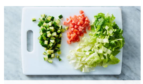
4. Prep salad

Preheat oven to 450°F with a rack in the upper third. Place 2 large eggs in a small saucepan. Add enough water to cover by 1 inch. Bring water to a boil over high, then cover and remove from heat until eggs are set, about 10 minutes. Use a slotted spoon to remove eggs from saucepan and place in a bowl of ice water.