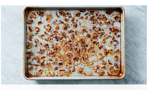
2. Roast mushrooms

While croutons bake, trim cucumber (peel, if desired), then halve lengthwise, scoop out seeds, and cut into ½-inch pieces. Core tomato and cut into ½-inch pieces. Halve lettuce lengthwise, then cut crosswise into ½-inch slices, discarding end.