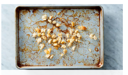
3. Bake croutons

While eggs cook, trim mushrooms and thinly slice caps. On a rimmed baking sheet, toss mushrooms with 2 tablespoons oil, BBQ spice blend, a generous pinch of salt, and a few grinds of pepper. Roast mushrooms on upper oven rack until deep golden-brown and starting to crisp, about 20 minutes. Transfer to a plate.