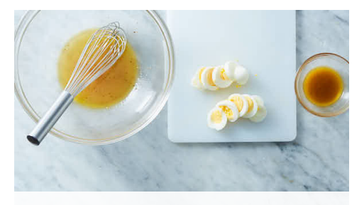
5. Make dressing

Onto same baking sheet, finely grate ½ teaspoon garlic and tear roll into bitesized pieces. Drizzle with oil, then toss bread and garlic with a pinch each of salt and pepper. Bake on upper oven rack until toasted, about 5 minutes (watch closely as ovens vary).