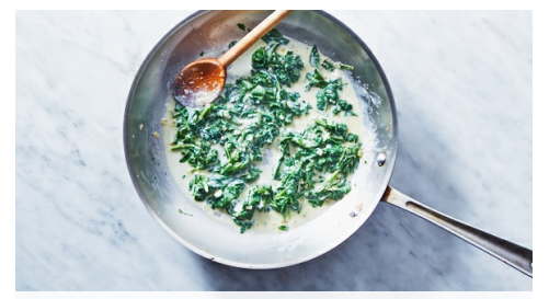
5. Make creamed spinach

Meanwhile, heat 1 teaspoon oil in reserved skillet over medium-high. Add remaining chopped shallots and cook, stirring occasionally, until golden, about 1 minute. Add spinach in large handfuls as it wilts. Toss until all is wilted, about 1 minute. Season to taste with salt and pepper .