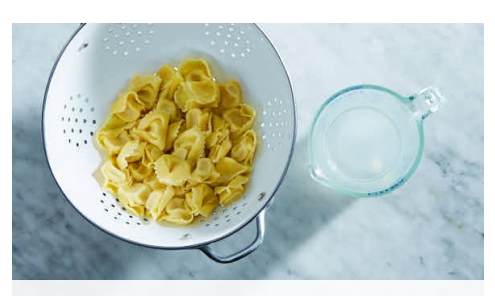
3. Cook tortelloni

Heat 1 tablespoon oil in a medium skillet over medium-high. Add bread cubes and cook, stirring occasionally, until golden and crisp, 3-4 minutes. Transfer to a plate. Wipe out skillet and reserve for step 4.