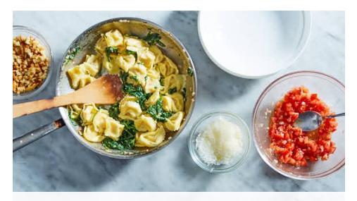
6. Finish tortelloni & serve

Off heat, add cream cheese and ¼ cup of the cooking water to spinach . Cook over medium-low heat, stirring to melt completely. Stir in ¾ of the Parmesan in large pinches to avoid clumping; season generously with pepper .