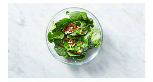
6. Finish & serve

Transfer tilapia to center oven rack and roast until panko is deeply browned and fish is cooked through, about 10 minutes (watch closely as ovens vary).