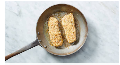
5. Roast tilapia

Pat tilapia dry and season all over with salt and pepper . Spread lemon-Dijon mixture on one side of each filet, then top with herbed panko , pressing gently to adhere. Drizzle same skillet with oil . Add tilapia, panko side up.