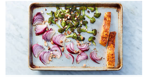
5. Roast salmon

While veggies roast, stir to combine 1 tablespoon oil and 1 teaspoon harissa spice in a small bowl. Pat salmon dry, then rub all over with harissa oil . Season with salt and pepper .