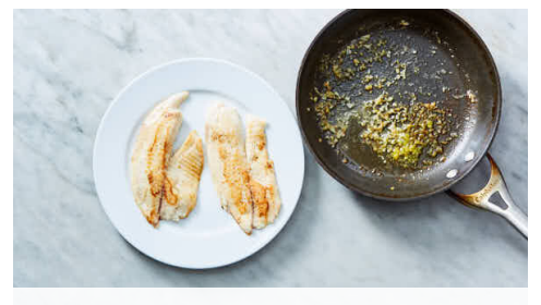
5. Cook fish

While cauliflower broils, heat 1 teaspoon oil in a large nonstick skillet over medium-high. Add snap peas and season with salt and pepper . Cook, stirring occasionally, until browned in spots and crisp-tender, 2-4 minutes. Transfer to a bowl and cover to keep warm until ready to serve.