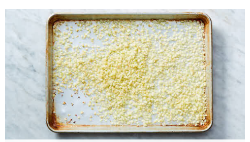
2. Broil cauliflower rice

Finely chop 1 teaspoon garlic. Pick and finely chop 2 teaspoons tarragon leaves; discard stems. Finely grate all of the lemon zest, then squeeze 2 tablespoons lemon juice into a small bowl, keeping them separate. Cut any remaining lemon into wedges. Thinly slice radishes. Trim snap peas.