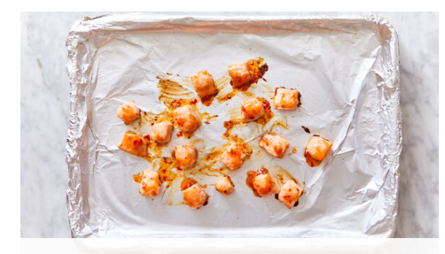
5. Broil salmon

Pat salmon dry, then cut into 1-inch pieces. Transfer salmon , 2 tablespoons Thai sweet chili sauce , and 1 tablespoon oil to a medium bowl. Season with salt and pepper , and stir gently to coat salmon in sauce.