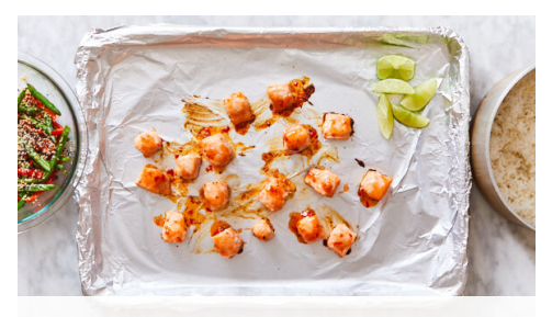
6. Finish & serve

Switch oven to broil. Line reserved baking sheet with foil. Transfer salmon to prepared baking sheet. Broil salmon on upper oven rack until browned in spots and cooked to medium, 5-7 minutes (watch closely as broilers vary). Spoon remaining sweet Thai chili sauce over salmon .