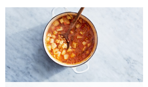
6. Finish soup & serve

Meanwhile, preheat broiler with rack in top position. Broil bread on top oven rack until golden brown on both sides, 1-2 minutes, turning halfway through (watch closely as broilers vary). Halve reserved whole garlic clove and rub it over cut sides of toasted bread; sprinkle lightly with salt .