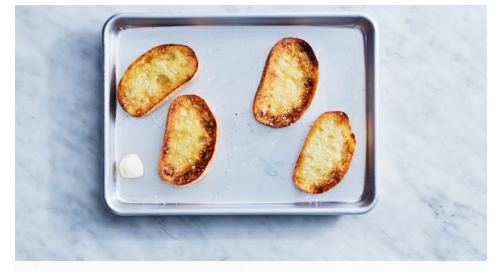
5. Make garlic bread

Add chopped tomatoes to pot and cook, stirring, until very dry, about 3 minutes. Add seafood broth concentrate , reserved tomato juice , 2 cups water , 1/4 teaspoon salt , and several grinds of pepper ; bring to a boil. Add potatoes , cover partially, and cook over medium heat until potatoes are just tender when pierced with a knife, 10-12 minutes.