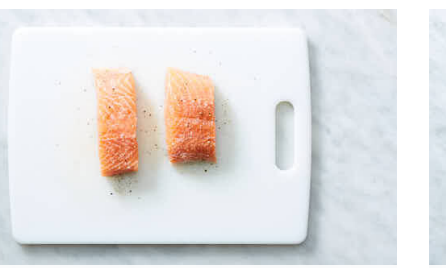
4. Prep salmon

In a small bowl, whisk to combine mustard, chopped rosemary leaves, honey, 1½ tablespoons each of oil and vinegar, ½ teaspoon salt, and a few grinds of pepper.