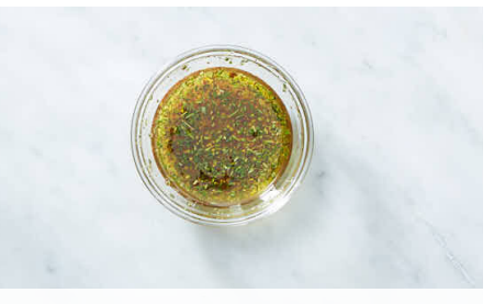
3. Prep dressing

Trim tough ends from asparagus . Pick and finely chop 1½ teaspoons rosemary leaves ; discard stems. Finely grate half of the lemon zest , then cut lemon into wedges; reserve both for step 6.