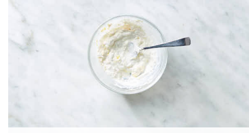
5. Make horseradish cream

Broil on top rack until salmon skin is golden brown and crispy and snap peas are blistered and browned in spots, rotating baking sheet halfway through cooking, 5-7 minutes total (watch carefully as broilers vary).