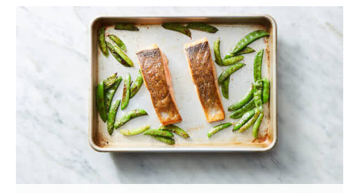
4. Broil salmon & snap peas

Meanwhile, on a rimmed baking sheet, toss snap peas with 2 teaspoons oil ; season with salt and pepper . Arrange in a single layer on edges of baking sheet. Pat salmon dry; rub each filet on both sides with 1 teaspoon oil and season both sides with salt and pepper . Place salmon in center of baking sheet, skin side up.