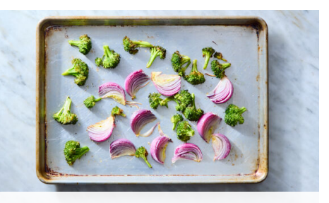
3. Roast vegetables

Heat 1 teaspoon oil in a small saucepan over medium-high. Add couscous and cook, stirring, until golden brown, 3-4 minutes. Add chopped garlic ; cook, stirring, 30 seconds. Add ¾ cup water and ½ teaspoon salt Cover and bring to a boil. Reduce heat to low; cook until couscous is al dente, 10-12 minutes. Stir in lemon zest and 1 tablespoon butter . Cover to keep warm.