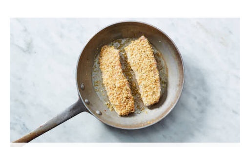
4. Season tilapia

Scrub potatoes , then cut into 1-inch thick wedges; transfer to a small saucepan. Add 2 teaspoons salt and enough water to cover by ½-inch. Bring to a boil; cook until easily pierced with a fork, about 5 minutes. Drain well, then return to saucepan; toss with 1 tablespoon butter . Cover to keep warm.