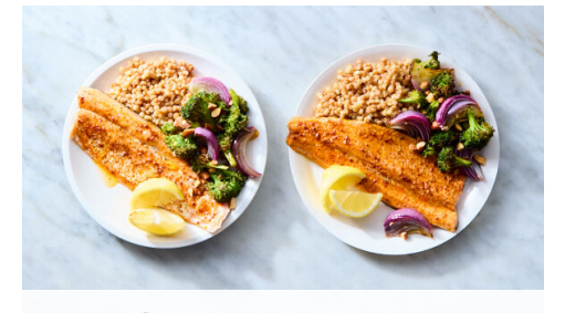
6. Finish & serve

Place trout on the baking sheet with broccoli and onions (if veggies are browning too much, remove before placing back in oven). Roast on upper oven rack until trout is cooked through and opaque, 8-10 minutes (or longer if desired). Coarsely chop almonds , then toss with vegetables on baking sheet.