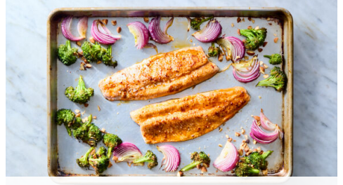
5. Roast trout

Pat trout dry, then rub all over with harissa oil . Season with salt and pepper .