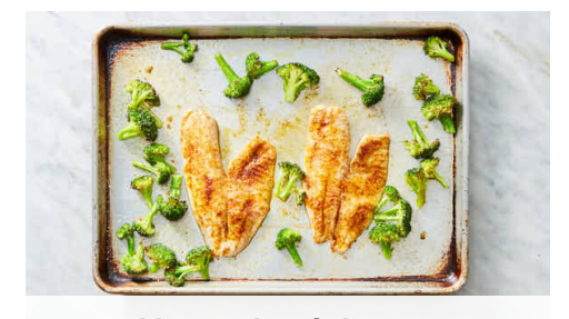
4. Broil broccoli & fish

Pat fish dry; rub all over with oil . Season with 2 teaspoons BBQ spice and a pinch each of salt and pepper .