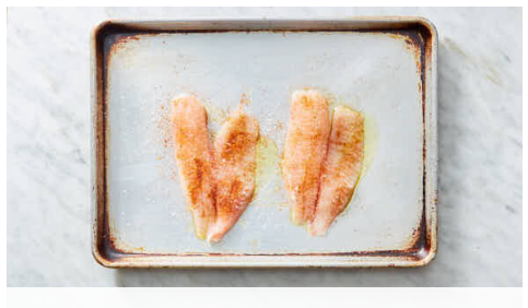
3. Prep fish

Finely chop onion . Finely chop 1 teaspoon garlic . Cut broccoli into 1-inch florets, if necessary. Finely chop chives .