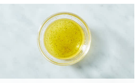
3. Make lemon dressing

Finely grate ¼ teaspoon lemon zest into a small bowl. Pick 2 tablespoons dill fronds from stems; finely chop 1 tablespoon. Keep remaining dill whole; discard stems. Add chopped dill to bowl with zest and season with salt and pepper. Trim stem ends of green beans.