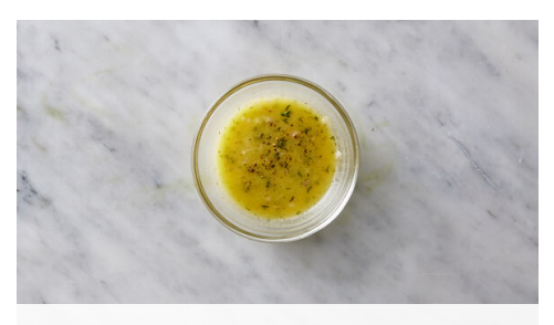
3. Make vinaigrette

Zest half of the lemon and separately squeeze 1 tablespoon + 1 teaspoon juice. Cut remaining lemon into wedges. Separate lettuce leaves, tearing any large leaves in half.