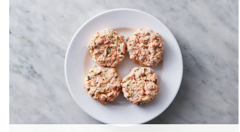
5. Make salmon cakes

Gradually whisk 2 tablespoons oil into remaining mixture. Stir in pickles, 1 tablespoon each of shallot and capers, and 1 teaspoon each of lemon juice and dill; set aside.