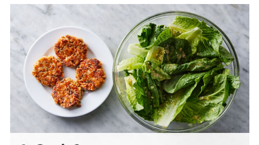
6. Cook & serve

Flake salmon in large pieces into bowl; season to taste with salt and pepper . Gently mix until combined, keeping salmon in relatively large flakes. Using wet hands, divide mixture into 4 (1-inch) thick cakes.