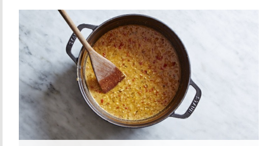
4. Start soup

Meanwhile, heat 1 tablespoon oil in a medium Dutch oven or pot over mediumhigh. Add onions and cook, stirring, until softened, 2-3 minutes. Add roasted peppers and chopped thyme and cook until very dry, 2-3 minutes.