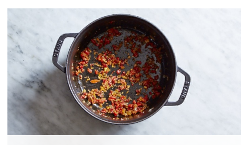
3. Sauté aromatics

Using a serrated knife, make 3 slices into each roll , stopping about ¾-way down (don't cut through). Lightly brush the insides with oil , and fill with half the cheese (reserve remainder for soup). Set rolls on a rimmed baking sheet and sprinkle any cheese that's fallen out on top. Bake until toasted and cheese is golden and melted, 8-10 minutes.