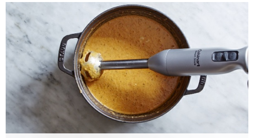
5. Finish soup

Add chickpeas and, using a potato masher or fork, mash to a coarse paste. Add reserved chickpea liquid , vegetable broth concentrate , and 1 cup water , and bring to a boil. Season with ½ teaspoon salt and several grinds pepper . Simmer until slightly thickened, about 5 minutes.