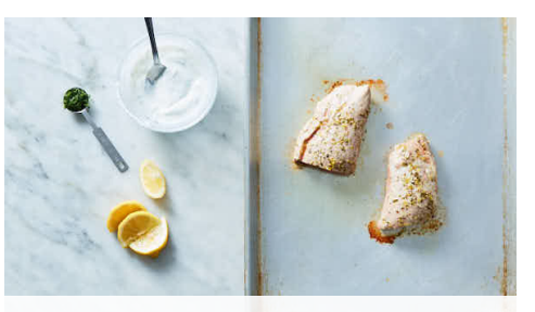
3. Make tzatziki

In a medium bowl, combine zucchini, 1 tablespoon oil , and ¼ teaspoon of the grated garlic. Season with salt and pepper , and toss to combine.