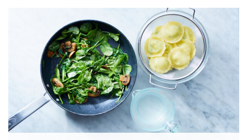
3. Cook ravioli

Rinse shrimp and pat very dry. Season with salt and pepper . Heat 2 teaspoons oil in a medium skillet over high. Add shrimp and cook until just curled and pink, 2-3 minutes. Transfer to plate with mushrooms .