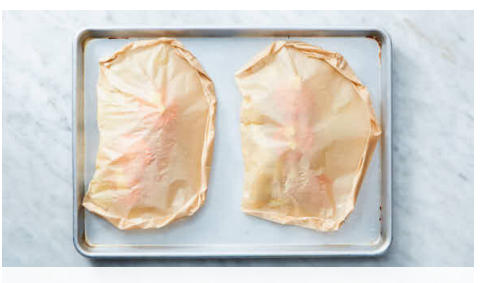
3. Fold packets & bake

Cut 2 (20-inch long) pieces of foil (or parchment paper). Divide zucchini between the 2 sheets, building in the center. Top each with 1 tablespoon butter and ½ teaspoon oregano . Lay 1 tilapia fillet over each pile of zucchini; sprinkle each fillet with ½ teaspoon of the chopped garlic and ½ teaspoon oregano.