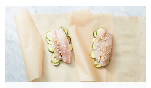
2. Build packets

Preheat oven to 450°F with racks in the center and upper third. Slice zucchini into ¼-inch thick rounds. Cut tomato into ½-inch thick slices. Drain artichokes (quarter, if necessary); set half aside for step 3 (save rest for own use). Finely chop 2 teaspoons garlic . Pat tilapia dry, then season all over with salt and pepper .