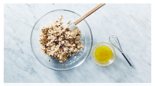
5. Dress grains

Transfer roasted lemon wedges to a medium bowl and press with a spoon to squeeze juice; discard rind and seeds. Whisk in 2 tablespoons oil , 1 tablespoon water , and 2/3 of the feta . Season to taste with salt and pepper .