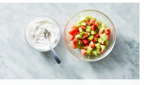
2. Make salad & garlic sauce

Peel cucumber , then halve lengthwise, scoop out and discard seeds with a spoon, and cut into ½-inch pieces. Cut tomatoes into ½-inch pieces. Finely chop 1½ teaspoons garlic . Pick cilantro leaves , then finely chop stems , keeping leaves whole.