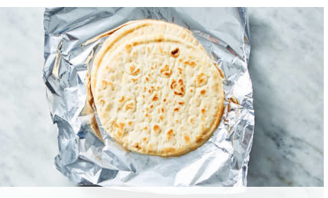
3. Toast pitas

In a small bowl, stir to combine all of the sour cream and remaining chopped garlic . Season to taste with salt and pepper .